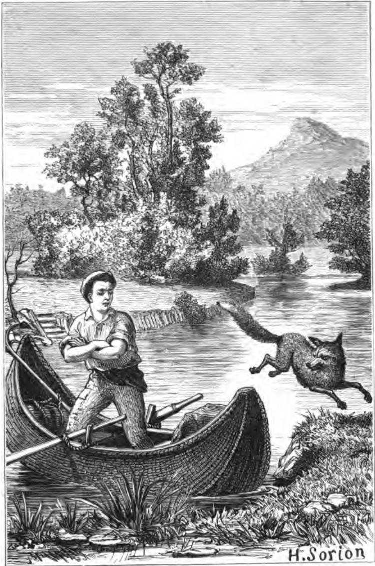
ACHERIA, THE FOX.—P. 43.